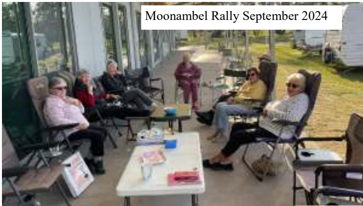
Moonambel Rally September 2024