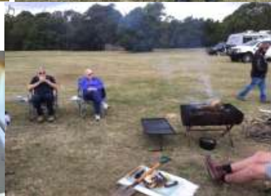
Perhaps the poor boy needs a bigger plate