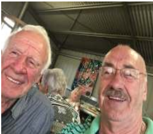
More photos of the Mortlake Rally