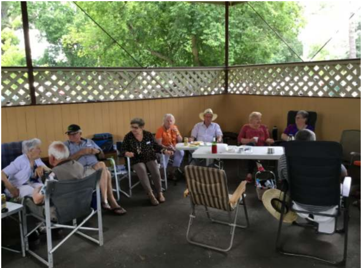
2021 New Year Lunch